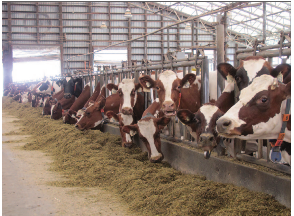
The 130 Ayrshire cattle at Balme Ayr Farms in Cobble Hill supply milk for Haltwhistle Cheese Co. in nearby Duncan.

Despite approximately 25 artisan cheesemakers in BC, Haltwhistle is the sole raw milk cheesemaker on